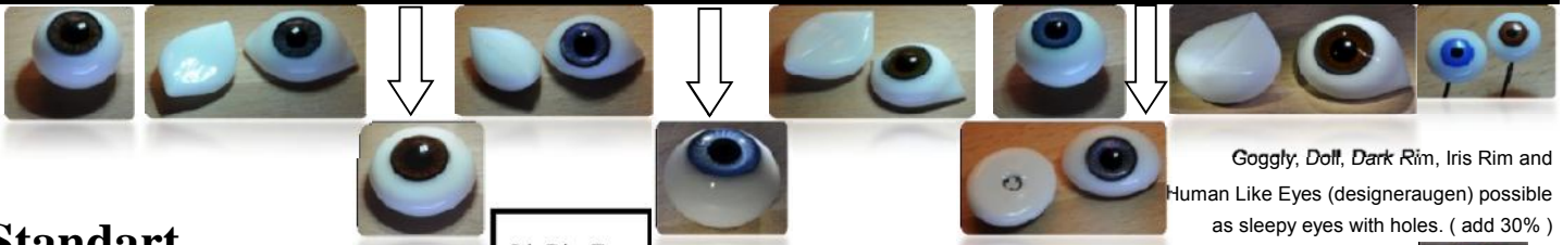
Goggly, Doll, Dark Rim, Iris Rim and Human Like Eyes (designeraugen) possible as sleepy eyes with holes. ( add 30% )